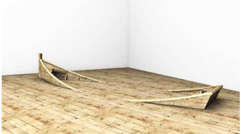
Crue , 2010 – model of project – © Stéphane Thidet

preview Thursday April 8th from 6 pm to 8 pm